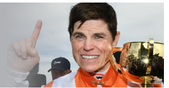
CHAMPION JOCKEY - CRAIG WILLIAMS

"Being a jockey is one of the most dangerous sports in the world. We are always looking for initiatives and products to make our job safer. The J2M barriers have been designed to ensure the welfare of horses and the safety of Jockeys and attendants, which is paramount. Having used them, I thoroughly endorse the J2M barriers".